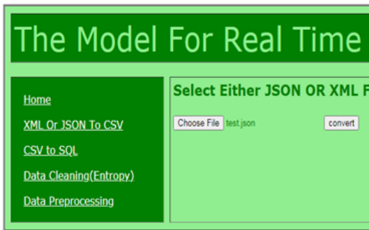
Fig. 2: selection of json file for convert