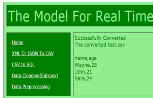
Fig. 3: Converted csv file from json

Fig.2 shows the json file selection for convert into csv. When user select the json file and click convert the json file will be convert into csv as display in fig.3.