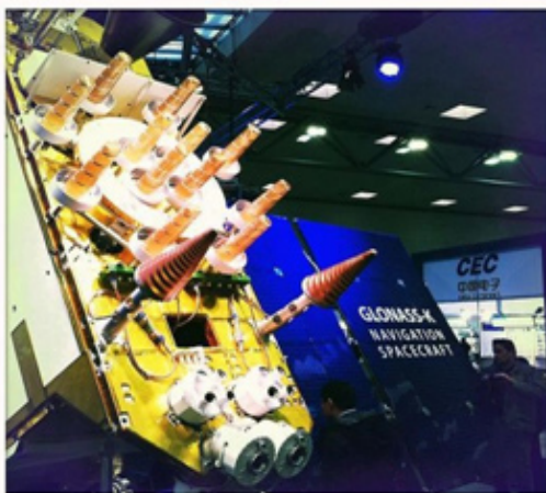
Fig. 6: GLONASS Satellite

These gimmicks are sometimes battery powered, but the newer units get powered by the electricity offered by the OBD connection. Check Engine light is lighted OBD-II port is connected to the handheld, and simply record and display any trouble code that the vehicle is accounting. Users can then apply the code to understand what is the miss with the car , once the problem has been recovered, delete the code from the vehicle's memory, by deactivating the Check Engine light until the next issue comes up.