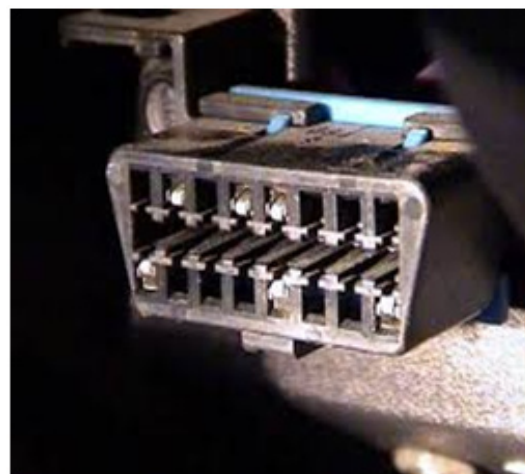
Fig.7: AIDE Structure in Cars