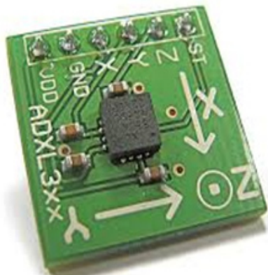
Fig. 4: Accelerometer

ECOMPASS introduces new mobility concepts and establishes a methodological framework for route planning. In addressing the environmental impact of urban mobility, optimization following a holistic approach. For providing the eco-awareness in urban multi-modal transportations ECOMPASS aims at presenting a comprehensive set of instruments and services for end users. Firstly, the project will concentrate on the purpose and evolution of intelligent on-board and centralized vehicle fleet management systems; by employing intelligent traffic prediction and traffic balancing method the eco-awareness will be addressed. Secondly, taking into consideration of information (such as location and time) as well user limitations and various restrictions, E-COMPASS can develop mobile and web services which can provide route planning for multi-modal public transportation. An important objective of E-COMPASS is to deliver the respective services to end-user mobile devices and develop novel algorithmic solutions.