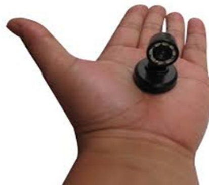
Fig. 3: Infrared camera

A built-in infrared (IR) camera allows for touch-less gestures, so drivers can answer a call by swiping left or dismiss an untimely notification by swiping right, all the while concentrating on the job at hand, e.g. not turning off the road and dying in a fiery wreck 2 .