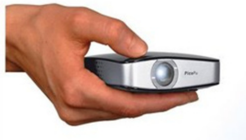
Fig. 1: Pico-projector

LCoS and DLP use a white light source, and some variety of filtering technique to make a