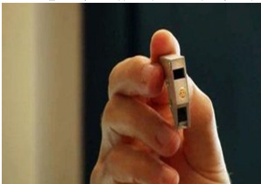
Fig. 2: Pico projector module

Laser-Beam-Steering (LBS): Using a directed laser beam projectors they can create the image one pixel at a time. Beginning with 3 different lasers (Red/Green/Blue), each at its required brightness, which are combined using optics, and guided using a mirror (or two mirrors in some conceptions). It is difficult to notice pixel-by-pixel pattern if we scan the picture fast enough (usually at over 60Hz). In that perspective they are several theoretical advantages to LBS over LCoS and DLP.