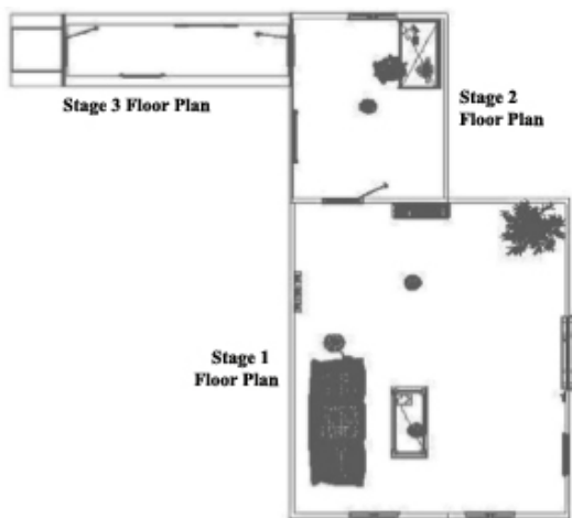
Fig. 3: A floor plan depicting changing size and features 27

Arachnophobia or arachnophobia is a specific phobia which is characterized by fear of spiders and is derived from Greek words Arachne meaning “spider” and phobos meaning “phobia”. An arachnophobic person tends to feel anxious or show signs of fear in any area that he/she believes could harbor spiders or upon the exposure to spiders. In addition to showing signs of anxiety and fear, participants also tend to hold the feeling of disgust because they might stimulate the feeling of disgust 11 or they might be associated with the spreading the diseases. Under the circumstances of exposure to spiders the person tends to show panic, might experience problems in breathing or can show emotional outbursts. This behavior can hamper a person’s interpersonal relationships, normal behavior or daily routines. Traditional treatment of arachnophobia includes systematic desensitization which involves exposure therapy or getting the individual to imagine situations. This exposure therapy can be implemented in vivo (using a live spider) or using a virtual reality environment.